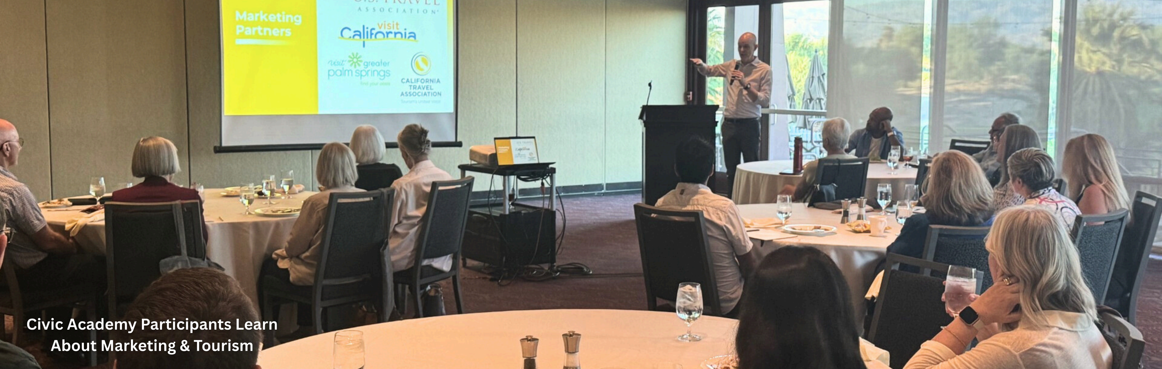
Civic Academy Participants Learn About Marketing & Tourism