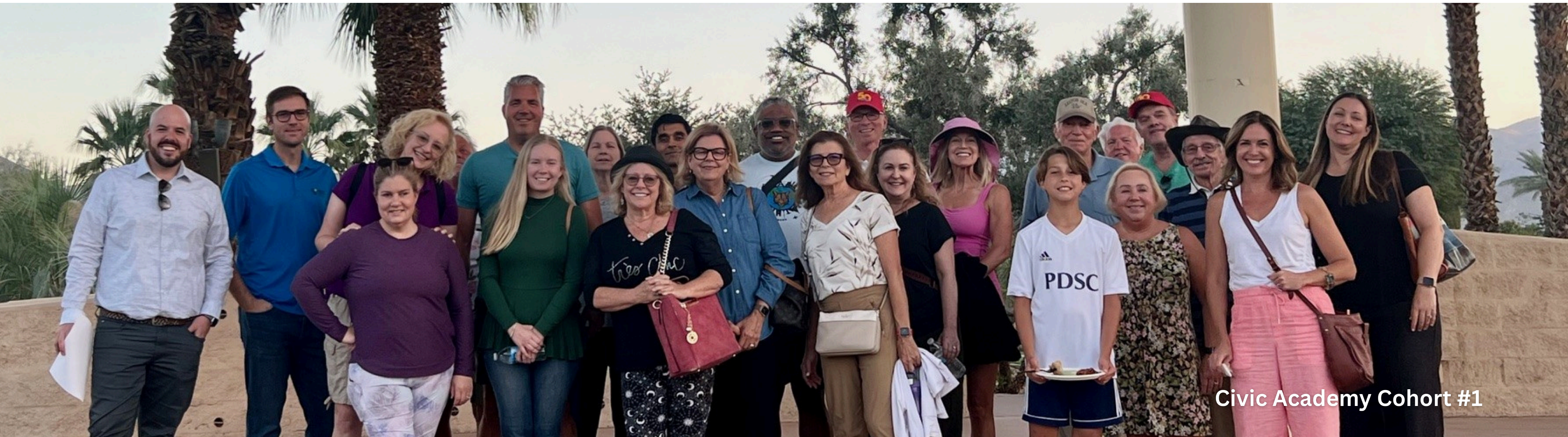
Civic Academy Cohort #1