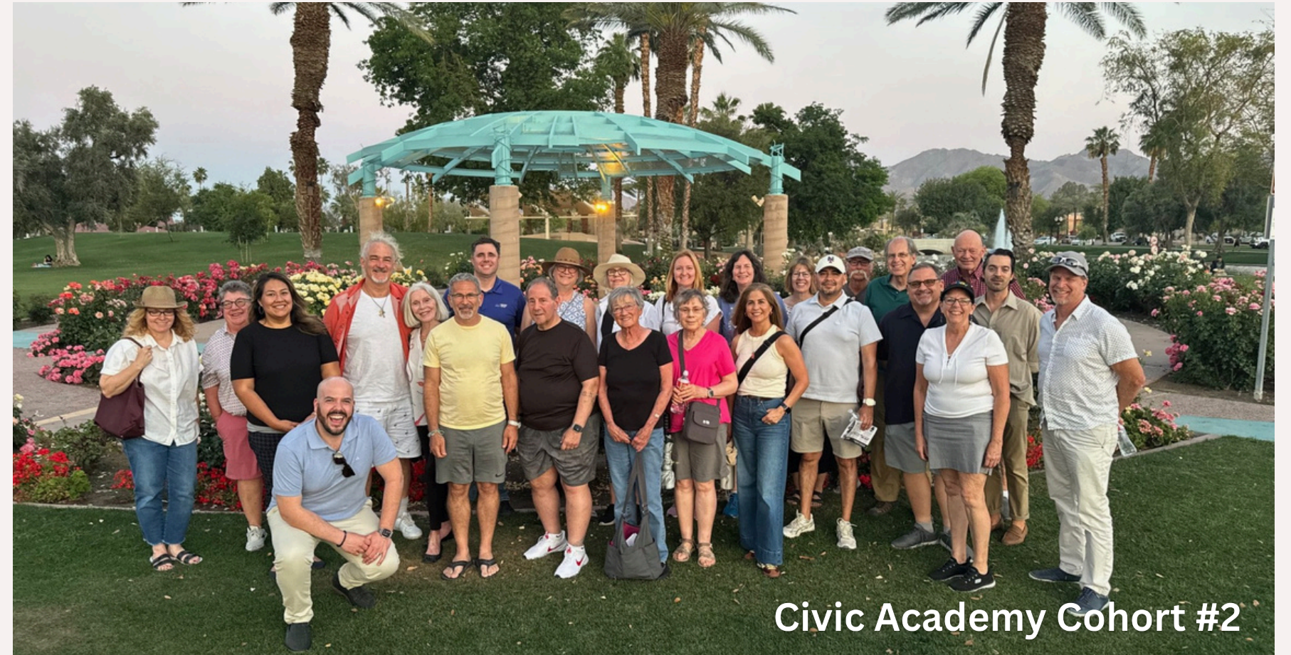
Civic Academy Cohort #2