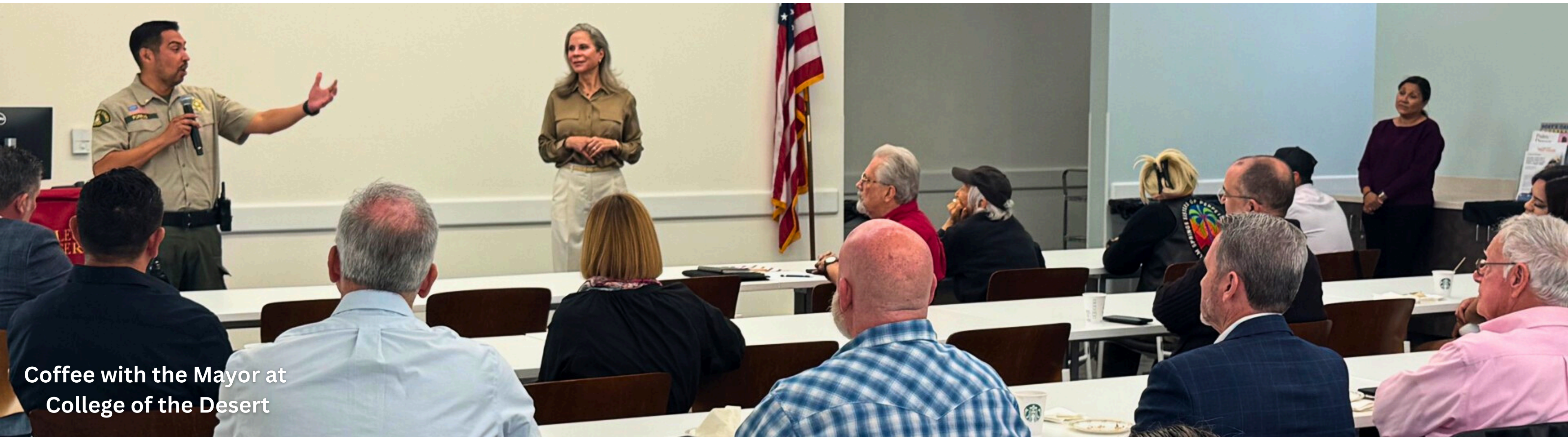
Coffee with the Mayor at College of the Desert

There Are Some Big Options for You to Consider!