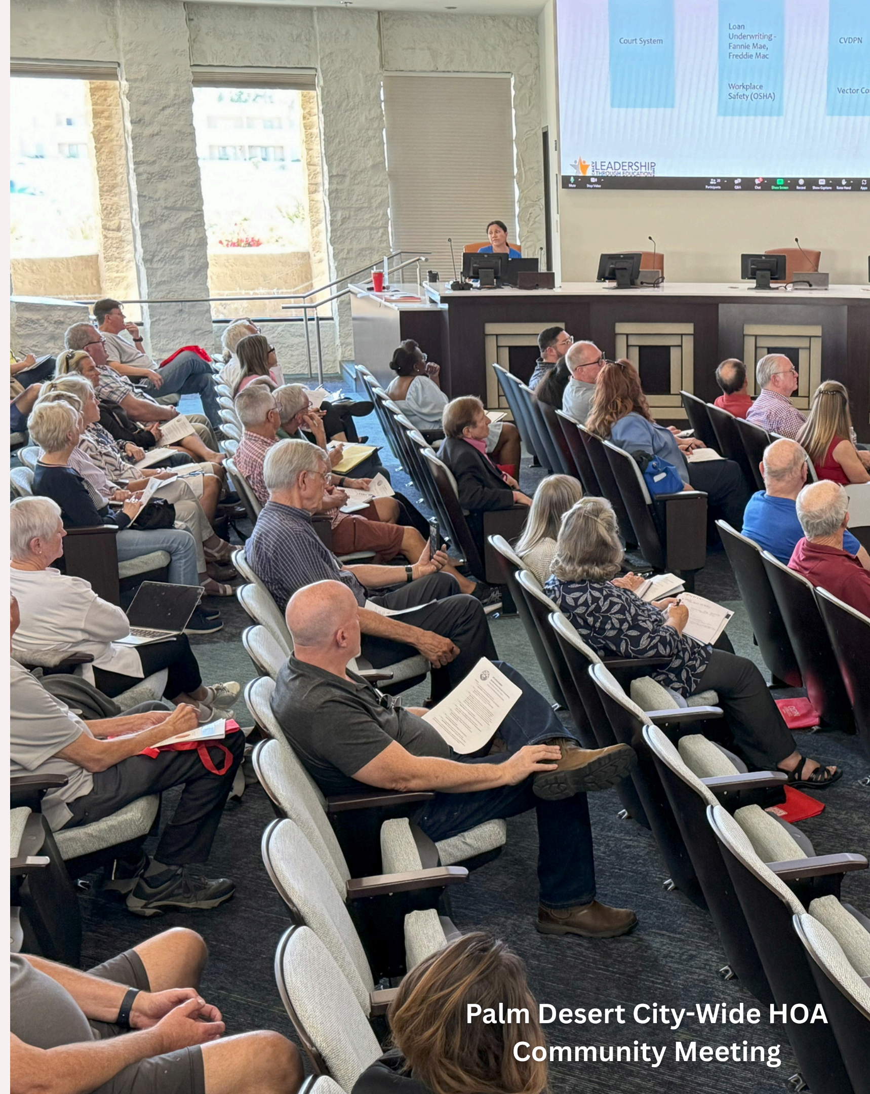
Palm Desert City-Wide HOA Community Meeting

To overcome internal resistance, it's essential to communicate the program's value clearly, showing how it aligns with organizational goals and enhances the city's reputation. By framing it as a strategic investment in community engagement and public trust, staff will better understand its long-term benefits.