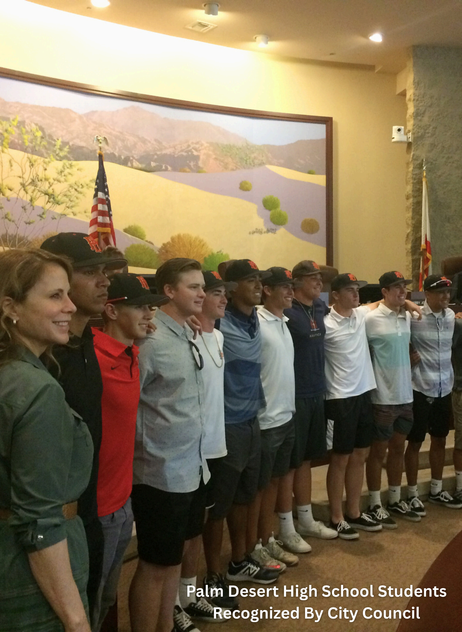
Palm Desert High School Students Recognized By City Council