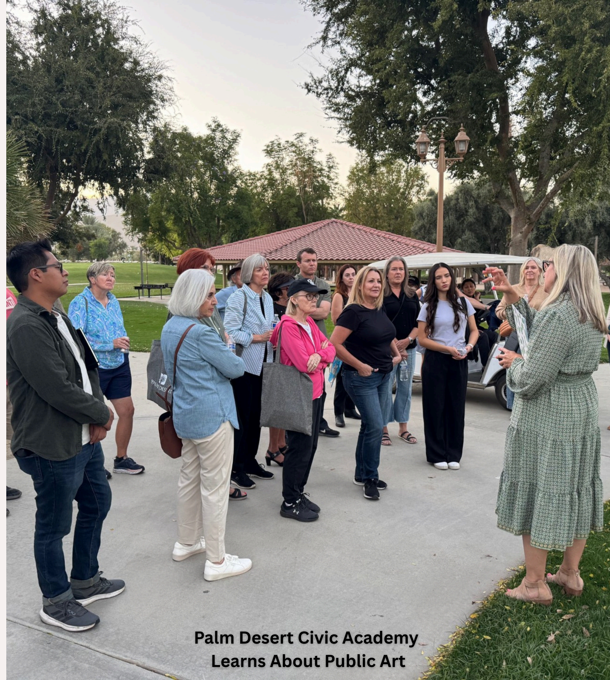
Palm Desert Civic Academy Learns About Public Art