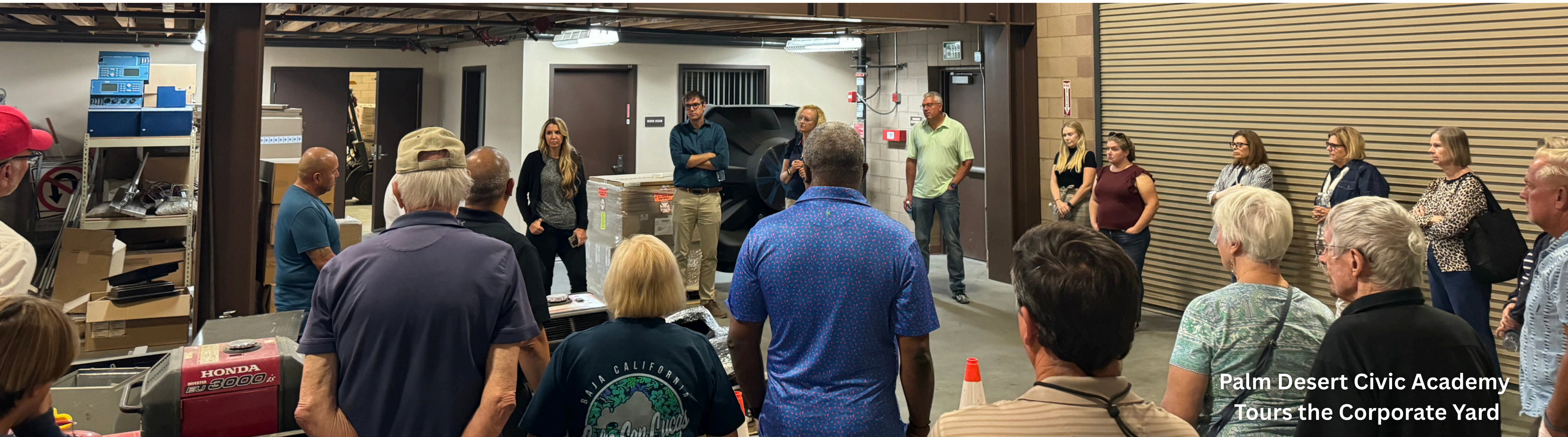
Palm Desert Civic Academy Tours the Corporate Yard