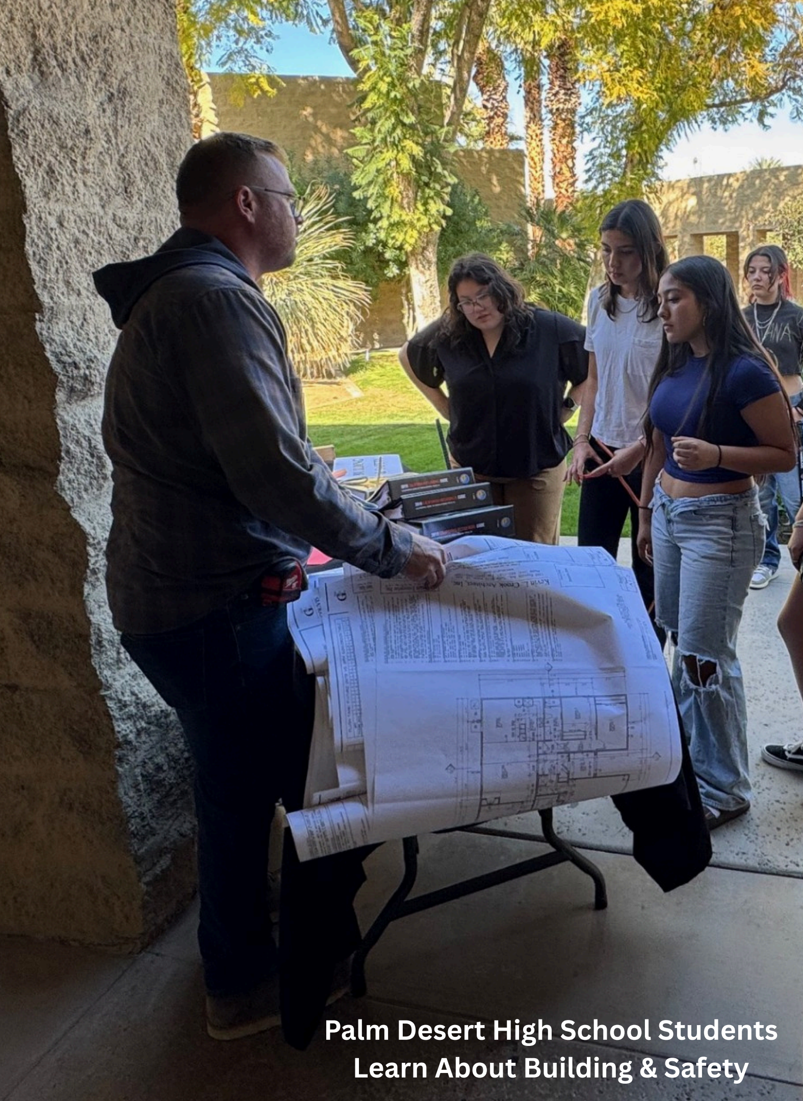
Palm Desert High School Students Learn About Building & Safety

An informed public provides valuable feedback, shaping projects while reducing misinformation. It enhances the organization's reputation, streamlines government processes, and frees up staff time. For elected officials, civic education offers a structured way to address public inquiries, ensuring engagement is focused on solutions.