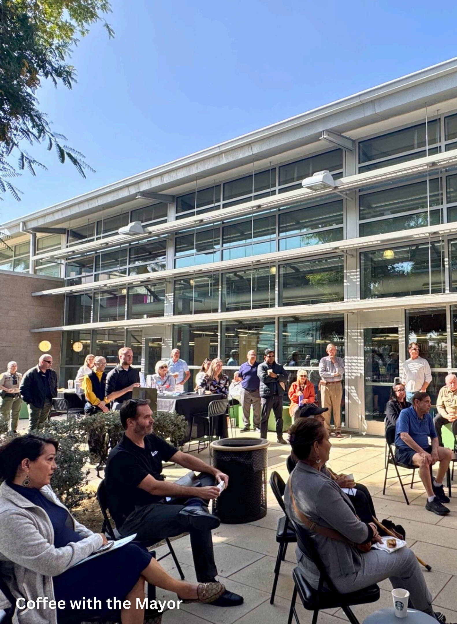
Coffee with the Mayor